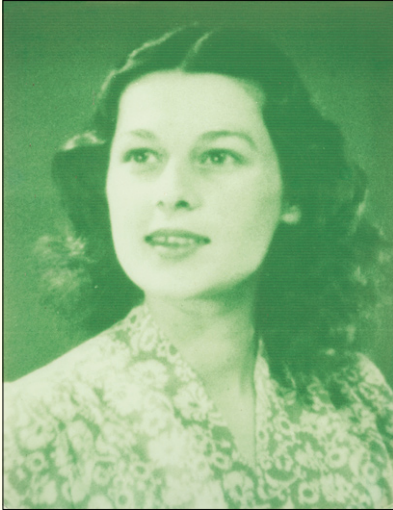
Violette Szabó – Croix de Guerre and Bronze Star

Please say a special prayer for her, remembering it is 80 years since she was arrested.